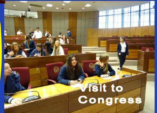
Visit to Congress

Our animals are all fine. Milly is our oldest dog and she will be 11 in August. She's still bouncy but she is showing signs of age now and always has something we need to medicate her for...she was one who never needed anything before. We sent Misty (our half persian cat who had long hair) for a bath the other week .She was so full of knots that they said she'd need to go again as it would hurt to do it all at once. We told them to cut it if it would be better for the cat. They took us at our word and we barely recognized her when she came back! Our cat that we thought was short and fat turned out to be tall and skinny under all the hair! It hasn't bothered her anyway! Her new hair is like velvet.